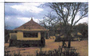
LAUNDRY/SHOWER AND KITCHEN