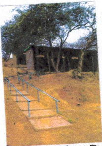
FLIGHT OF STAIRS TO THE WATER TANK BATTERY