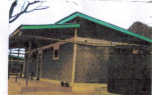
CHILDREN'S HOUSE N. 1